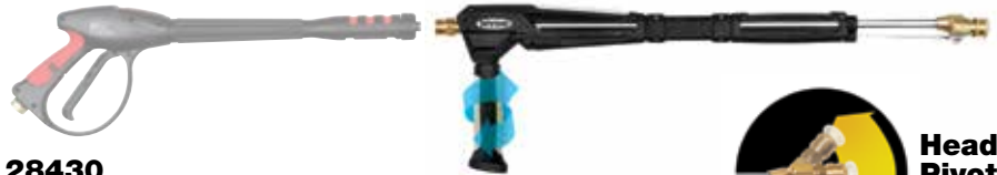
28430 28" Chrome-Plated Pivot Nozzle Wand / M22 style

Also referred to as a pressure washer lance. Rated for up to 4000 PSI. Soft-touch, rubberized grip provides non-slip control. Patented twist grip pivots the nozzle as you work. Heavy duty, lightweight housing has a chrome-plated steel shaft, providing durability and corrosion resistance.