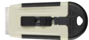
13040 Glass Scraper plus 5 Blades Ergonomic design with overmold for comfort and sure grip. Stores up to 5 blades in handle. 5 blades included.