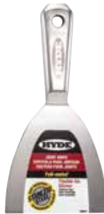
06580 4" Stiff Full-metal™ Stainless Steel Joint Knife with Hammer Head®