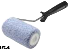
47354 4" E-volution® Mini Roller Cover with Frame, 3/8" Nap