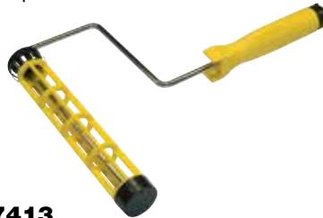
47413 9" Heavy-duty Roller Cage Frame with metal retaining ring Professional cage frame with thick durable wire and ergonomic plastic handle. Metal retaining ring reduces walk off of roller covers and knock off used roller feature.