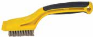
46800 Stainless Steel Stripping Brush Brush area measures 1-1/8" x 2-1/4" with .15mm bristles. Overmold handle.