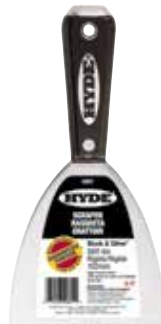
02601 4" Stiff Black & Silver® Joint Knife with Hammer Head®