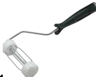
47401 4" 4-wire Roller Cage Frame, with 10" handle Value 4" roller cage frame with plastic handle and acme thread