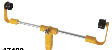
47420 18" Adjustable Flexi-Frame Roller Cage Frame Patented design eliminates roller cover walk off. Even pressure across the entire roller. No mess cover removal after use. Acme threaded handle for use with paint poles. Angle setting for use with floor applications.