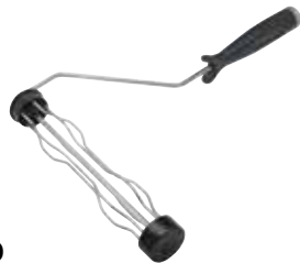
47410 9" 5-wire Roller Cage Frame Durable 5 wire design reduces roller cover walk off. Plastic handle and acme thread included for use on paint poles.