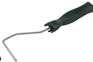
47400 4" Roller Frame, 10" handle Value roller frame with plastic handle and acme thread included for use on paint poles.