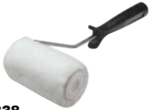
47338 4" Woven-Ultra™ Mini Roller Cover with Frame, 3/8" Nap