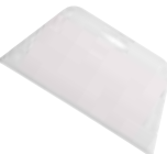
45806 9" Smoothing Tool Tapered blade made from durable stiff ABS plastic. Rounded corners protect walls from damage. Use as a straight edge for cutting.