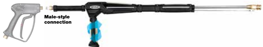
28440 40" Chrome-Plated Pivot Nozzle Wand / 1/4" style