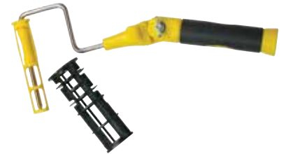
47402 4" Adjustable Roller Cage Frame with 3/4" and 1-1/2" diameter adaptors 4" roller cage frame with two roller size adaptors. Fits mini, 3/4" and 1 1/2" roller covers. Soft grip plastic handle with acme thread for use on Pait poles. Adjustable angle on the handle for use in hard to reach places and comfort during use.