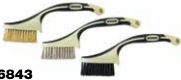
46843 Mini Brush 3-Pack (Brass, Nylon, Stainless)