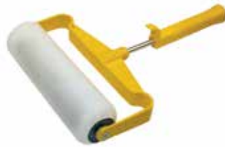
47412 9" Flexi-Frame Roller Cage Frame with Woven Ultra™ 3/8" Nap Roller Cover Patented design eliminates roller cover walk off. Even pressure across the entire roller. No mess cover removal after use. Built in bucket hook and acme threaded handle for use with paint poles.