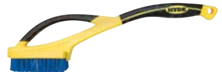
46816 Long-handle Nylon Brush Brush area measures 2" x 4-1/2" with soft nylon bristles. Overmold handle.