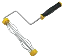
47411 9" 5-wire Pro Roller Cage Frame, soft grip handle Durable 5 wire design reduces roller cover walk off. Overmolded plastic handle for comfort during use, and acme thread included for use on paint poles.