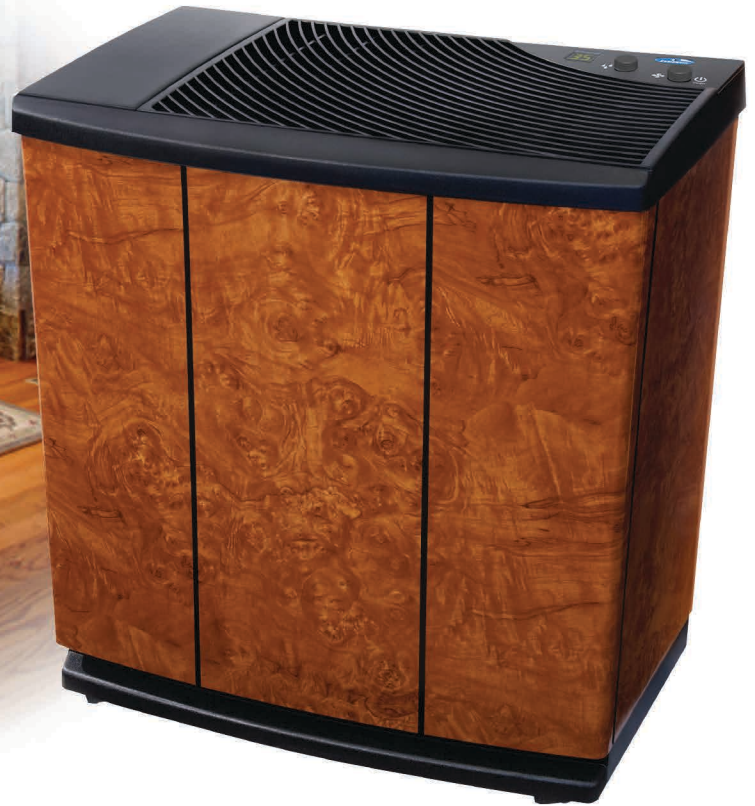
H12 400HB Oak Burl