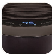
Digital Touch Screen Adjustable Humidistat Auto Shutoff Water Refill and Check Filter Indicator

Built in the USA of domestic and imported components