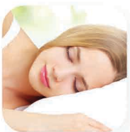
Quiet 9 Speed Control