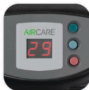
Digital Display Adjustable Humidistat Auto Shutoff Digital Controls Water Refill and Check Filter Indicators