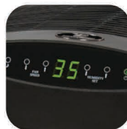
Digital Touch Screen Adjustable Humidistat Auto Shutoff Water Refill and Check Filter Indicator