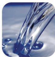
Easy-fill Front Fill Reservoir