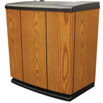
H12 300HB Light Oak