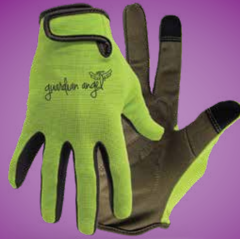
802 M, L