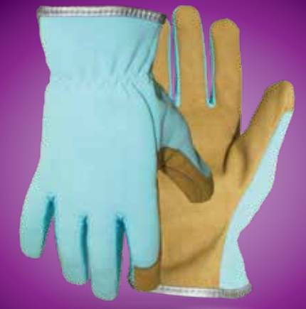
784 ONE SIZE