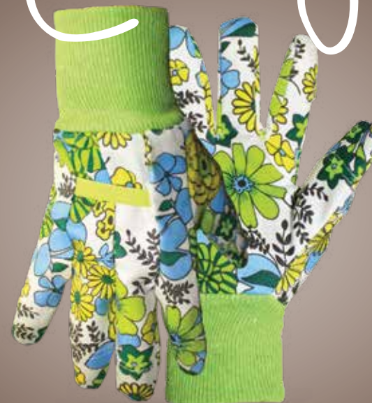
750 ONE SIZE