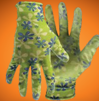
9407 ONE SIZE

Flexible nylon shell with floral pattern. Clear nitrile coated palm and fingers. Knit wrist seals out dirt & debris.