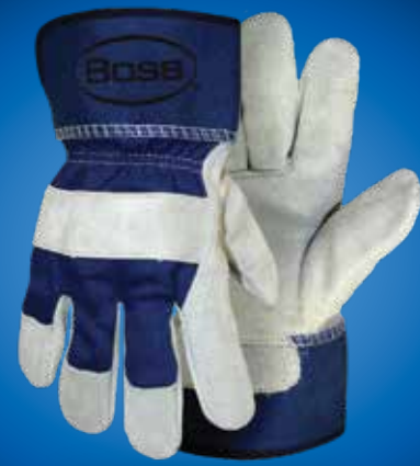
4095UC ONE SIZE

Dries soft after getting wet. Excellent heat and abrasion resistance. Grain pigskin palm, finger & fingertips. Safety cuff for extended wrist protection. Leather grade: premium.