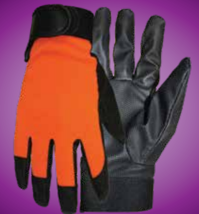
780 ONE SIZE