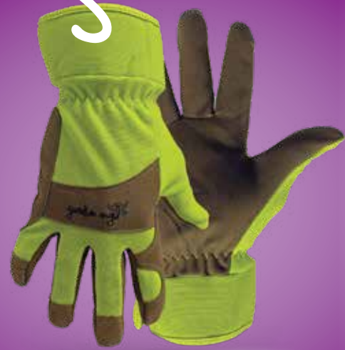
8410 ONE SIZE