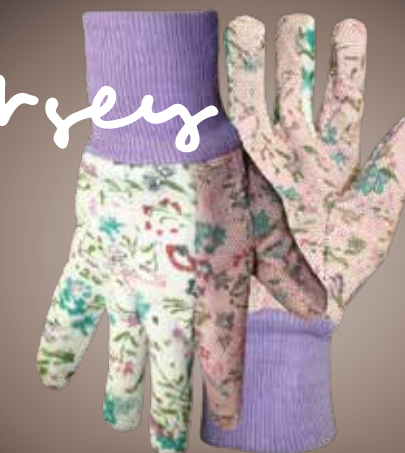
751 ONE SIZE