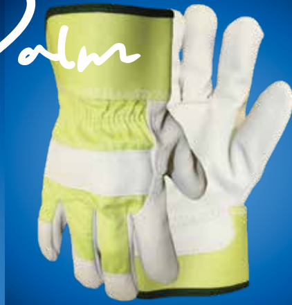
743 M, L