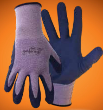
8433 ONE SIZE