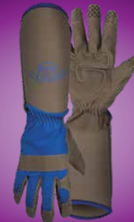
8419M L, X