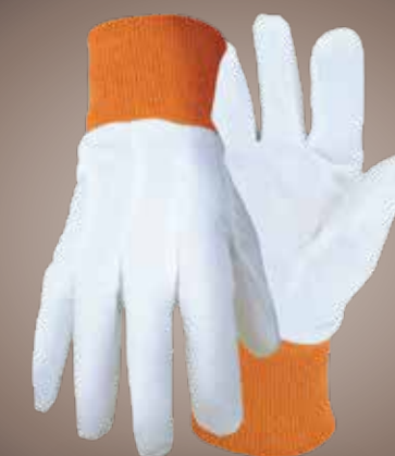
736 ONE SIZE

Packaged in assorted colors. Breathable cotton for comfort and ventilation. Elastic band for flexible fit. Knit wrist seals out dirt. Reinforced fingertips for longer wear. One size fits most.