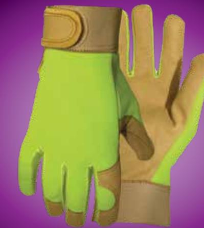
783 ONE SIZE