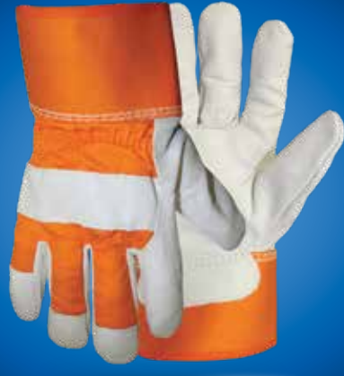
744 M, L