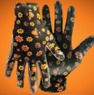
9406 ONE SIZE