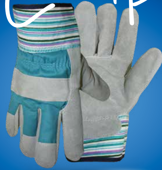
749 ONE SIZE