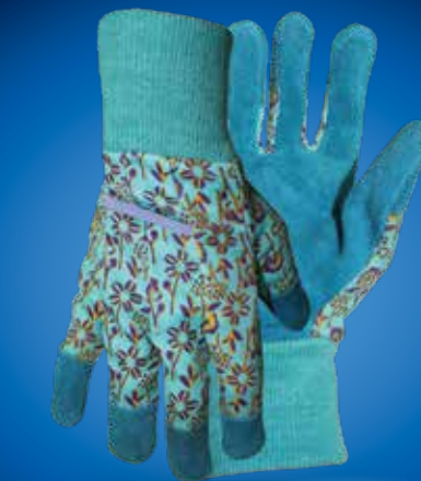
752 ONE SIZE