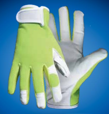
781 ONE SIZE

Cotton back for ventilation and comfort. Durable split leather palm and fingertips. Form fitting design. Knit wrist locks out dirt. One size fits most. Leather grade: standard.