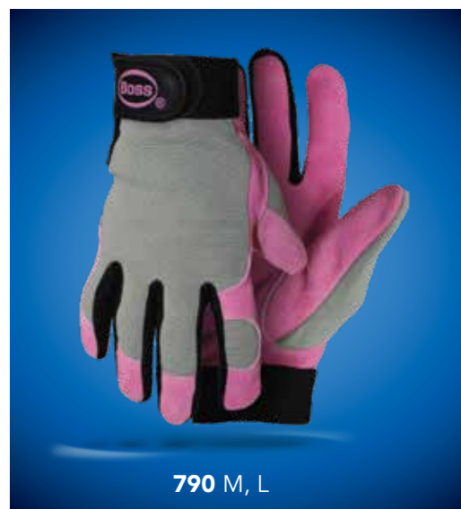
790 M, L