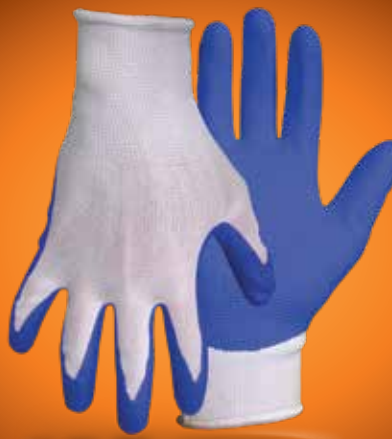
8428A ONE SIZE

Dipped & dotted nitrile palm & fingers. Stretchable nylon shell. Knit wrist. Assorted colors (Purple, Red).