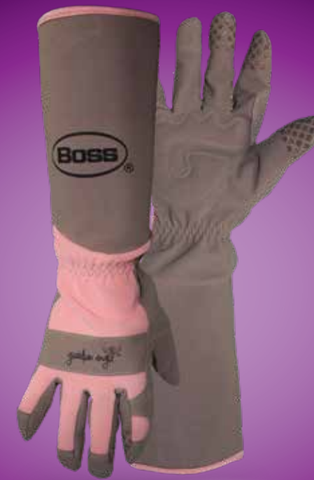
8419B, C, T S, M, ONE SIZE