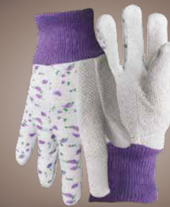
745 ONE SIZE