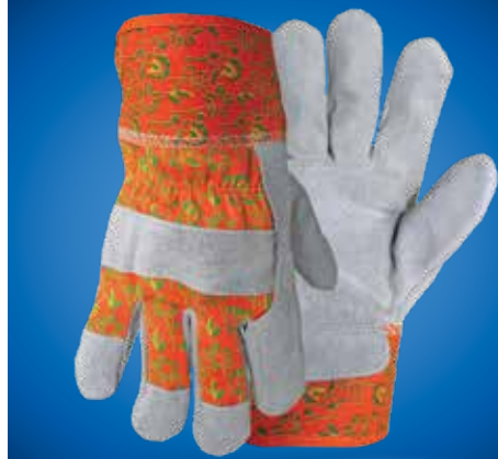
728 ONE SIZE