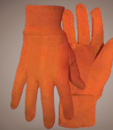
738 ONE SIZE