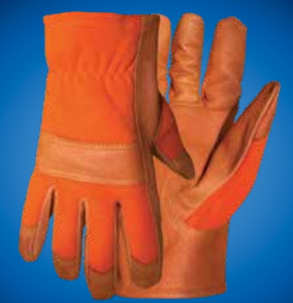
791 ONE SIZE