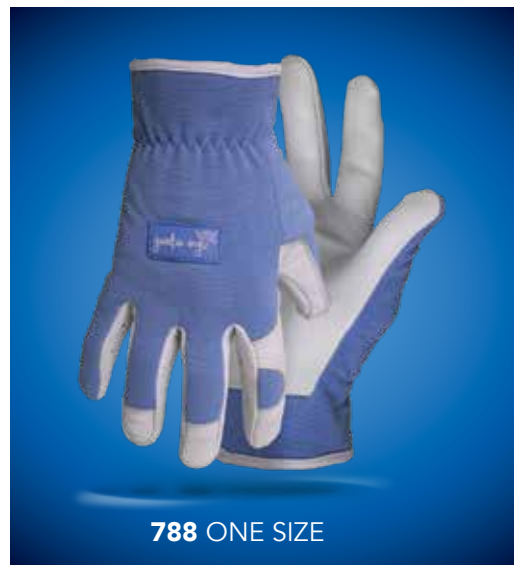
788 ONE SIZE