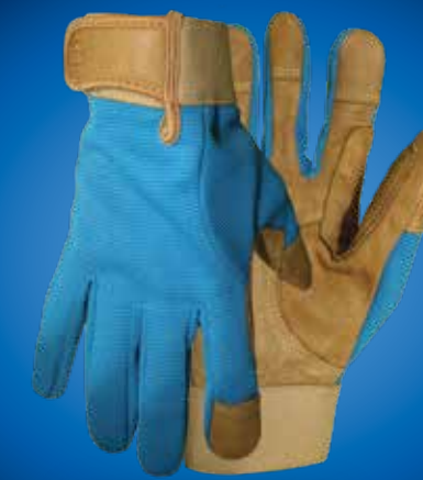
793 M, L