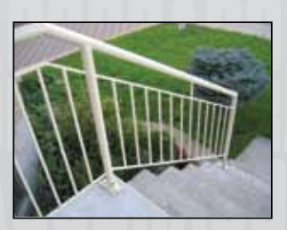
Hand rails on concrete