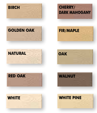
Colors are approximate.