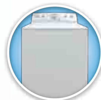
TRADITIONAL TOP LOAD