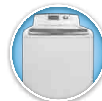
HE TOP LOAD