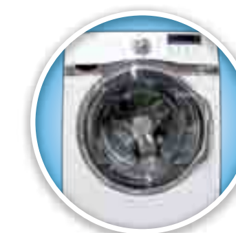
HE FRONT LOAD

● = 5 Year Warranty ● = Lead Free* 🇨🇦 = Available in Canada