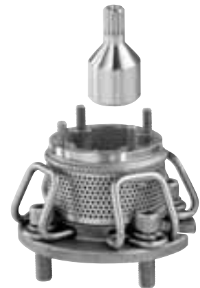
4" SUBMERSIBLE ACCESSORY