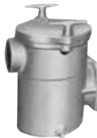
PKG 51 6" Trap