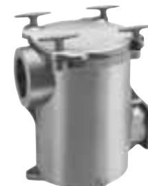
PKG 98 8" Trap