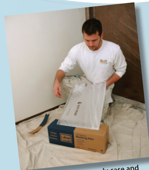
Grip-N-Guard's sturdy case and cored roll allow for easy dispensing.

GripNGuard clings to virtually any surface with minimal or no taping required. The outer surface of GripNGuard has been tested to retain dust 3 ½ times better than most plastic drop cloths. Dust, paint, sawdust and other airborne particles cling to the GripNGuard surface and are not reintroduced to the area during repositioning or cleanup. That means less clean up time, lower costs and higher profits.