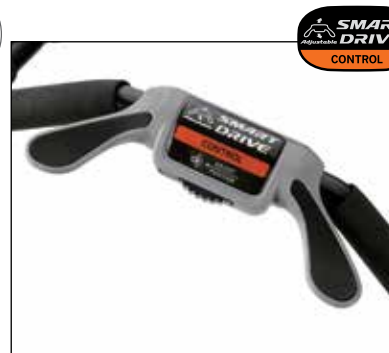
Adjustable Smart Drive