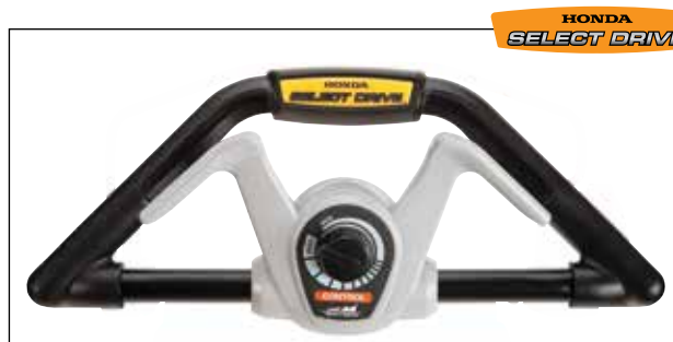
Select Drive™ System