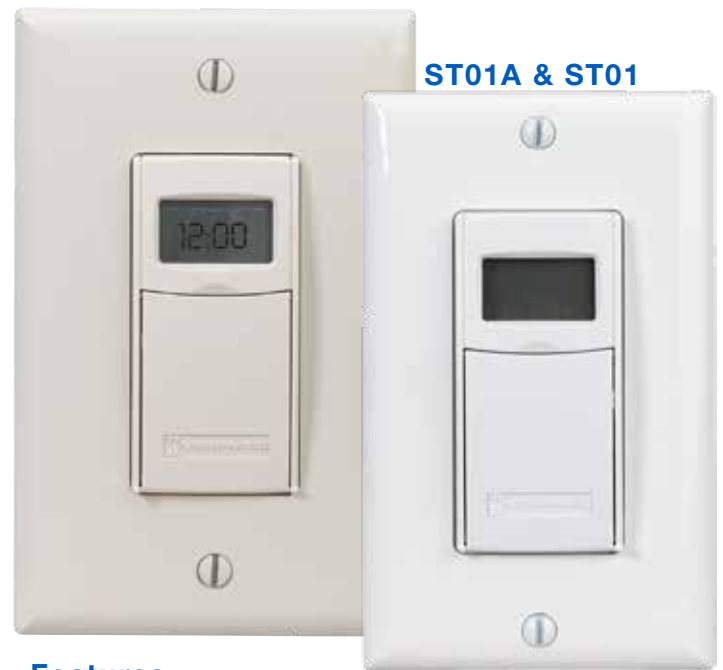
ST01A & ST01