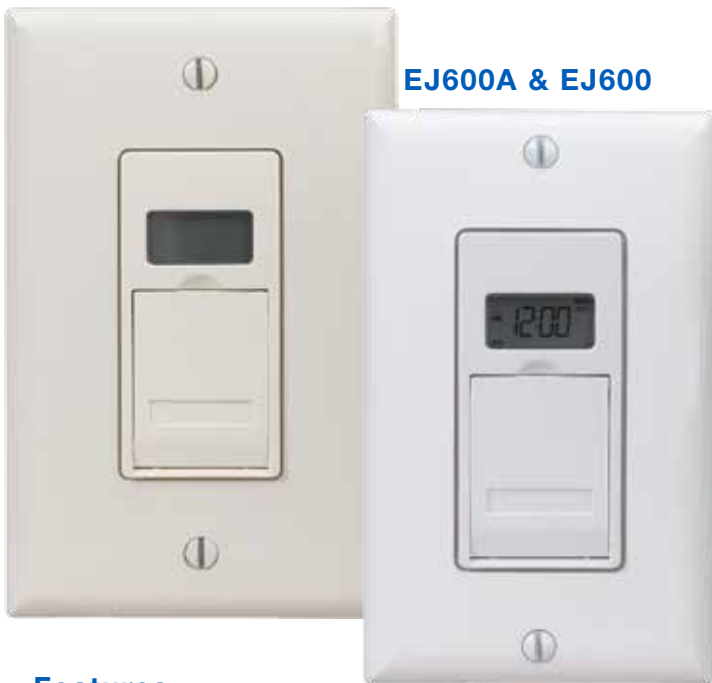
EJ600A & EJ600