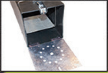
Quick Access For Baiting