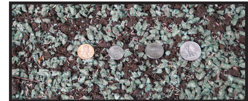
Close up of Lawn Repair

Remove dead grass with a rake and loosen soil. Some settling may occur during shipment, turn unopened bag upside down and shake prior to use. Sprinkle Lawn Repair on bare ground evenly. Water area twice daily for one to two weeks. Then water once a week, or as needed. Water if the mulch dries out and turns grey. New grass should start to emerge in 10 - 14 days. Seed germinates best when daytime temperatures are between 60°F and 80°F.