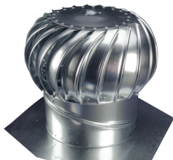
GEB-12 & GT-12 (shown) GALVANIZED STEEL TURBINE † ADJUSTS TO 7/12 ROOF PITCH AVAILABLE IN MILL ONLY