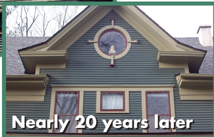
Nearly 20 years later

This information should not be considered complete as space is very limited. Use proper painting tradecraft on all projects. Product information, technical specification, application guidelines, warnings, MSDS, and more available at: