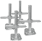
SET OF 4 BASE PLATES MODEL: I-IBBF4 UPC: 778300001699