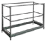
GUARDRAILS SYSTEM MODEL: I-BM6GR UPC: 778300100491