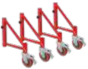
SET OF 14 IN. OUTRIGGERS WITH CASTERS MODEL: I-BMSO4 UPC: 778300100262