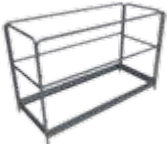
GUARDRAILS SYSTEM MODEL: I-BMSGGRJP UPC: 778300001828