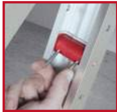
AUTO-LOCKING SYSTEM WITH LOCK INDICATOR DEVICE