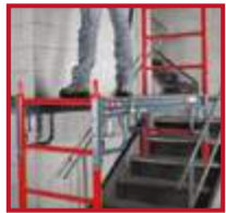
TIGHTENING HANDLE FOR MORE STABILITY