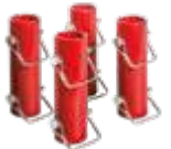
SET OF 4 COUPLING PINS MODEL: I-BM6C4 UPC: 778300100538