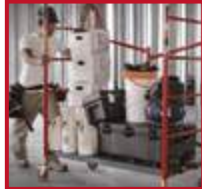
TRANSPORT 1,000 LB (454 KG) CAPACITY