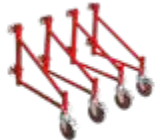
SET OF 14 IN. OUTRIGGERS WITH CASTERS MODEL: I-BM604 UPC: 778300100477