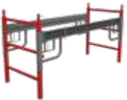
39 IN. HIGH EXTENSION MODEL: I-BMSSEX UPC: 778300001323