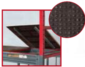
SAFECLIMB TRAP DOOR AND ANTI-SLIP DECK