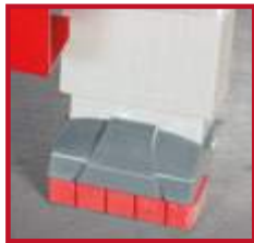
ANTI-SLIP HEAVY-DUTY FOOTING