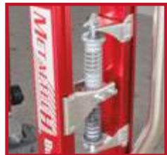
DUAL SPRING ACTION