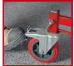
THREE 6 IN. (15 CM) DOUBLE LOCK HEAVY DUTY SWIVEL CASTERS