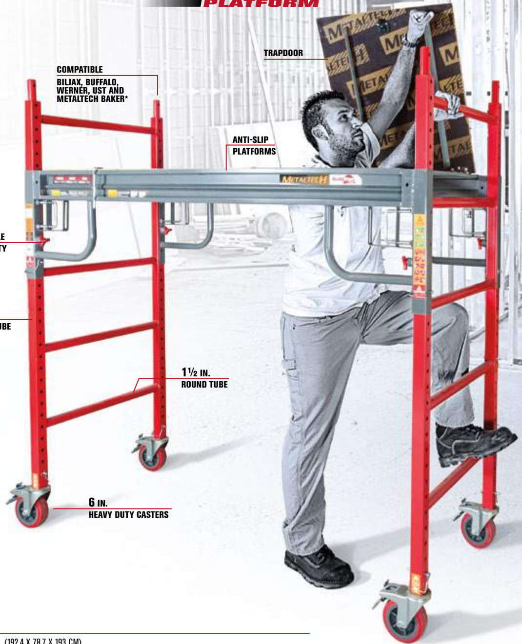
COMPATIBLE BILJAX, BUFFALO, WERNER, UST AND METALTECH BAKER*