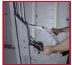
MULTI-STAGE CHAIN MECHANISM