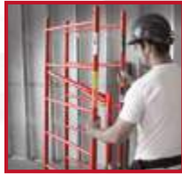
FOLDS FLAT FOR COMPACT STORAGE AND TRANSPORT