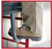
SAFECLIMB RUNG STEP