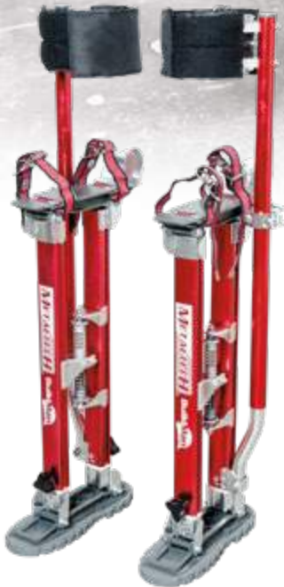
CONTACT GRIP ONE PIECE RUBBER OUTSOLE