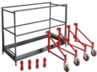
GUARDRAILS AND OUTRIGGERS COMPLETE SYSTEM MODEL: I-BM6SK UPC: 778300100361