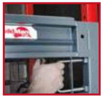
QUICK AND EASY HEIGHT ADJUSTMENT