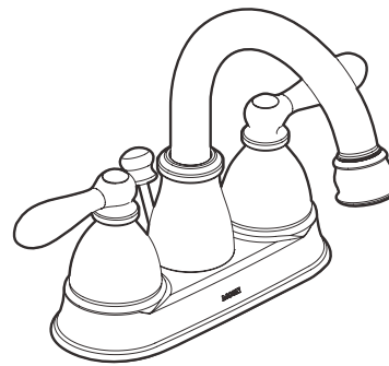
CALDWELL™ Two-Handle Lavatory Faucet