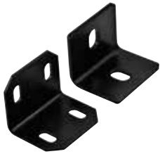
SQUARE CORNER BRACES