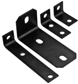
CORNER BRACES - OFFSET LEG