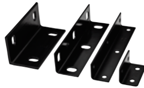
WIDE CORNER BRACES