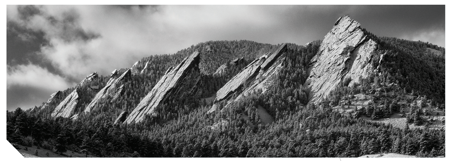
LOCATED IN BOULDER, COLORADO, USA