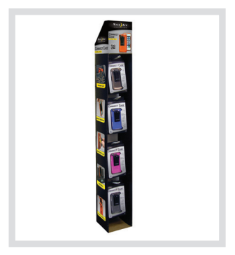
SIDE KICK DISPLAYS