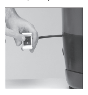
Turn off main power switch and unplug unit from wall outlet.