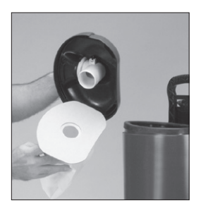
*Front panel removed for illustration of HEPA filter removal only. Housing removal is not necessary for filter inspection/replacement.