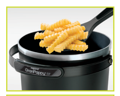
Handy scoop lifts, drains, and serves. No messy basket.