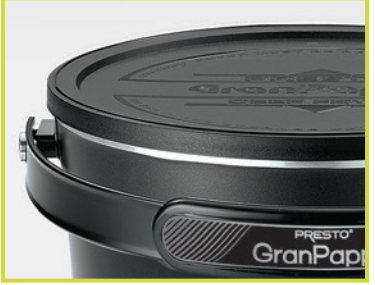
Snap-on lid stores oil without spills or odor.