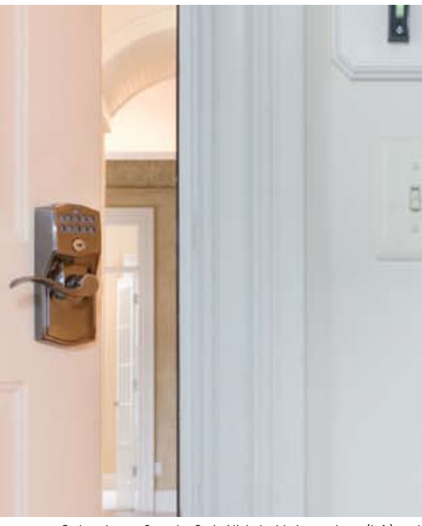
Styles shown: Camelot Satin Nickel with Accent lever (left) and Camelot Antique Pewter with Accent lever (above)