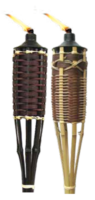
5' Classic Torch | #Y2952D 5 ft. Asst. bamboo | 24 pc display 3.6" x 60" height