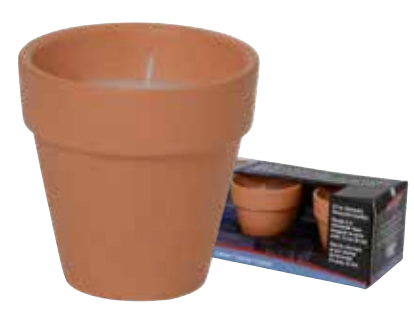
Citronella Terracotta Candle | #Y2406 3 pk | 15 set case 3.5" x 3.5"