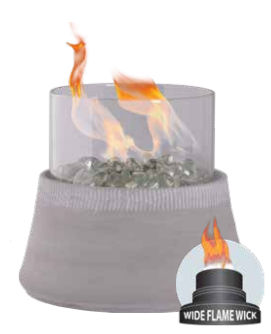
Decofire<sup>®</sup> Bancroft Small | #Y2680 Glass shade included 7.3" diameter x 6.3" height