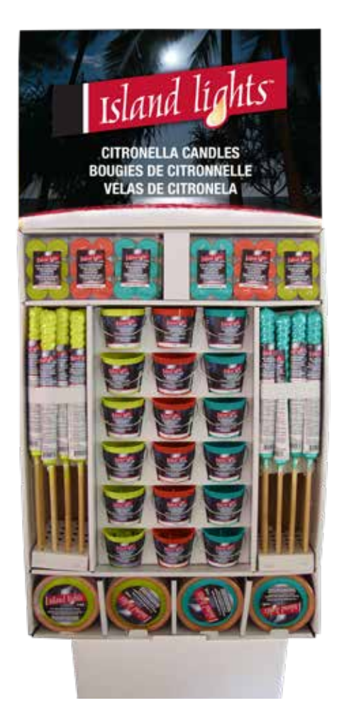
Citronella Candle Display | #Y2428D Asst Colors | Lemon Lime, Tangerine, Agave Blue 152 pc.