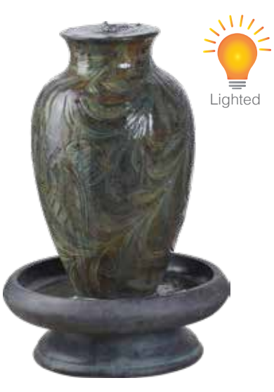
Grand Aria | #Y95337A 16.9" x 15.4" 28.35" Cast of durable, lightweight, Envirostone<sup>™</sup> for easy maneuverability ProCoat<sup>®</sup> finish for long lasting color and detail Integrated lights add interest and enhance ambiance

Brielle | #Y96591 19.8" x 19.8" x 28.7" Cast of durable, lightweight, Envirostone<sup>™</sup> for easy maneuverability ProCoat<sup>®</sup> finish for long lasting color and detail Integrated lights add interest and ambiance UL/CUL registered pump/transformer included