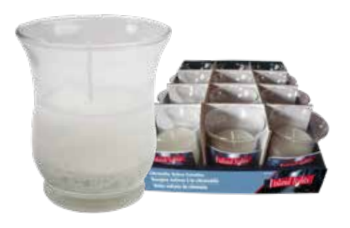
Glass Votive Candle | #Y2394 12 pc PDQ | 24 pc master case 3" x 3.5"