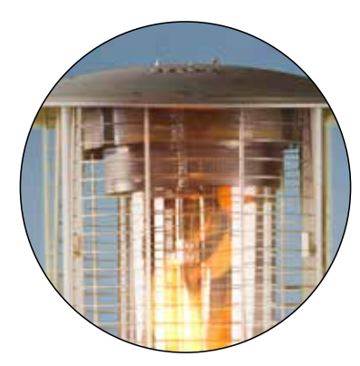
Dual Layer Heat Screen The dual heat radiation screens provide more heat output than single layer screens. Dual screens on the top end of the heater provide more opportunity for heat output.