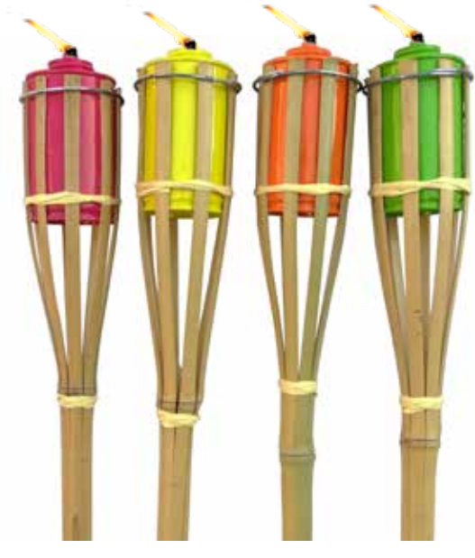
4' Promo Bamboo Torch | #Y2090 Assorted colors | 48 pc cut case 2.36" x 47.24" height