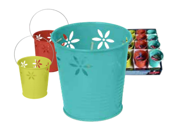
Citronella Bucket Candle | #Y2401 24 pc PDQ Asst colors: blue, green and orange 4.3" x 4"