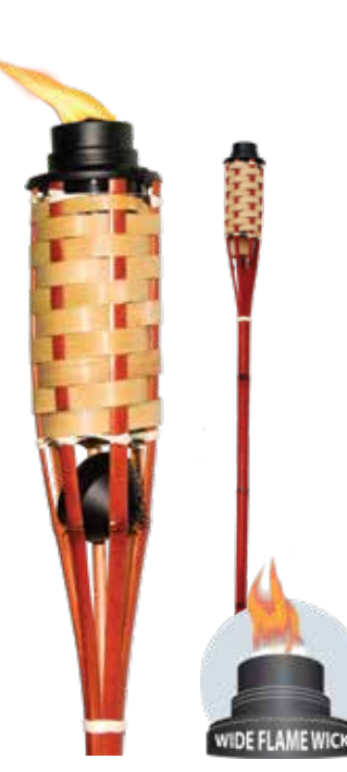
Ohauna Torch | #Y2717B 5 ft. Bamboo | 24 pc display 3.6" x 60" height