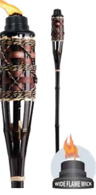
Konani Torch | #Y1156B 5 ft. Bamboo | 24 pc display 3.3" x 59" height