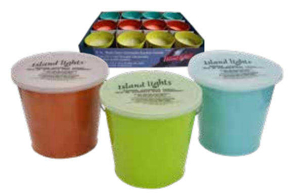
Citronella Bucket Candle | #Y1088 12 pc PDQ Assorted colors: lemon-lime, tangerine, and agave blue 5" x 4.7"