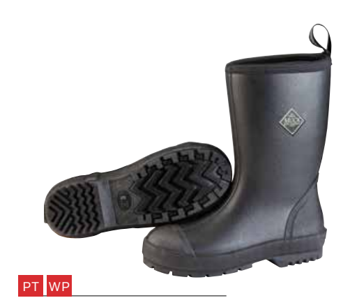
Chore - Mid