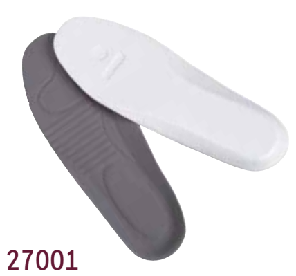
Foot Form Insoles