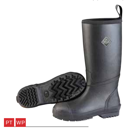
Chore - Hi