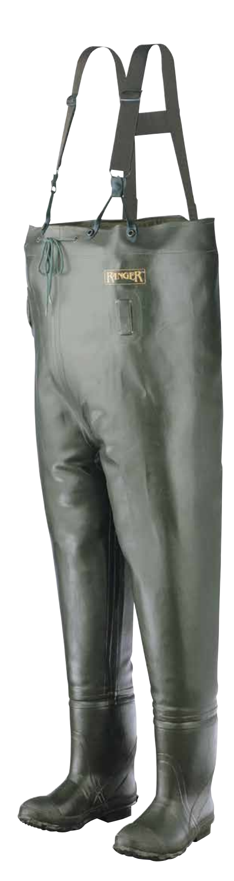
Suspenders and belt sold separately