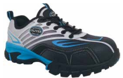
CT EH WP