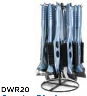
Counter Display Spinner Rack