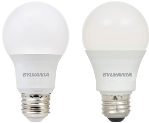
450lm and 800lm