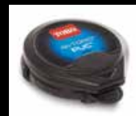
Add functionality with the Toro Portable Usage Calculator (PUC™)