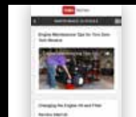
View maintenance how-to videos and illustrated instructions