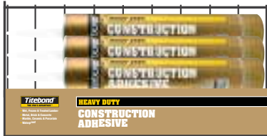
28 oz. Single Bin Basket -17956 18" w x 8" h x 15.25" d