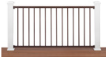
Bronze aluminum rails, Classic White posts and Bronze square aluminum balusters