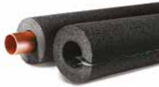
Tundra and Tundra SS