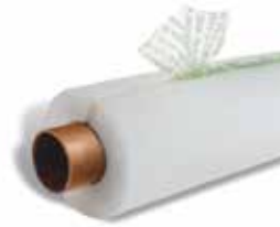
Tundra W SS