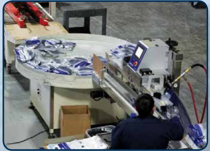
Complete packaging services available. Bagging, tagging and bar coding are just a few of the value added services we offer.