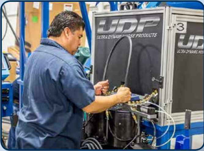
Hose assemblies fabricated to customer requirements - our specialty. Let us know what your requirements are.