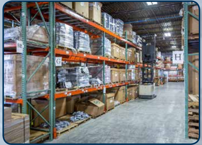
Inventory on-hand to service our customer needs. Large stocks for immediate shipment.