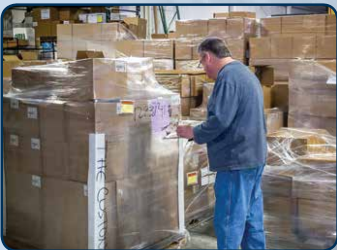
Inspection and quality is paramount with unparalleled customer service.