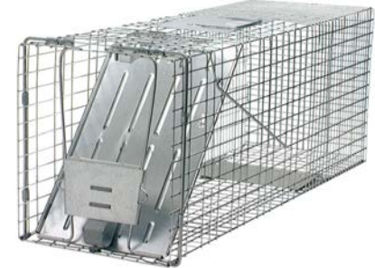
Wildlife Control Traps and Repellents