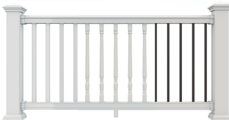
1 3/8" Square Balusters