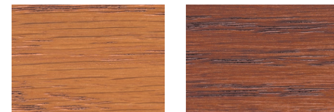
VINTAGE MODERN 129 MOROCCAN RED 118

If you want your décor to reflect your worldly sensibilities and appreciation of the extraordinary let this diverse compilation of stains let your imagination –and décor – wander off to exotic places. Infuse a space with comfort and joy by mixing textures, sculptures, and complementary tones. Sourced from the warm side of the color wheel, these decorative solutions can be irreverent and spicy, delightfully sophisticated, or just plain fun. As an example, for a French Country or Mid-Century Modern approach, blond wood flooring dotted with mahogany furnishings is multi-layered and memorable. This collection of colors can take you on a journey or showcase the places you've been.