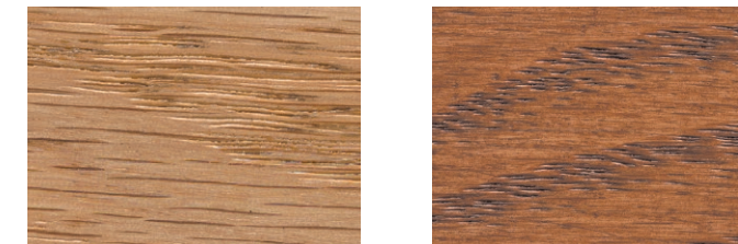
CHAMPAGNE 508 MINK 128

Afraid to be trendy? Stain colors are the perfect fix to make something you have look trendy without spending tons of money. There is no better way to keep your home looking fresh than adding the latest color into your design palette. Boho Chic, shiplap, open shelving are all on trend and can be stained with a color that inspires you. This takes your outdated room and just like that you're in vogue. Better yet, take something that is OUT and make it relevant with the right trendy color.