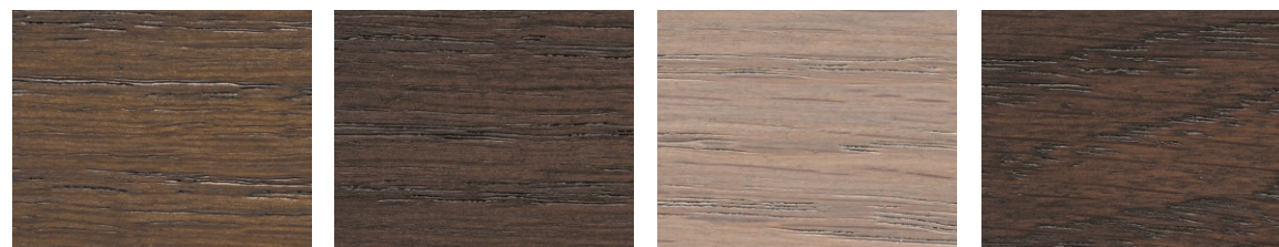
OILED LEATHER 503 BLACK CAVIAR 135 SILK GRAY 170 BABY GRAND 121

Everyone loves the flexibility of neutrals. These colors can create an open, calming, spacious environment or – when combined creatively – a dramatic, invigorating statement design. Showcasing furniture and accessories has never been easier as antique heirlooms, rustic metal, and woven rugs pop against this palette. If sophisticated and elegant is the goal, black stained wall paneling and chocolate leather couches make an unforgettable combination. If the design aesthetic is shabby chic, beach sophisticated, or casual ease, white satin glazed floors, brick, and ceilings will create a carefree, barefoot-friendly living space.