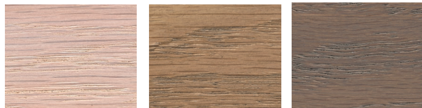
BEACH HOUSE 139 GRAY CASHMERE 504 MALIBU GRAY 171