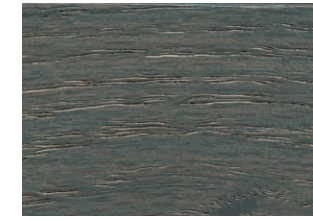
BLUE MOON 509