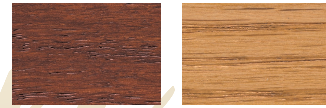
EXOTIC REDWOOD 124 GOLDEN SUNSET 127