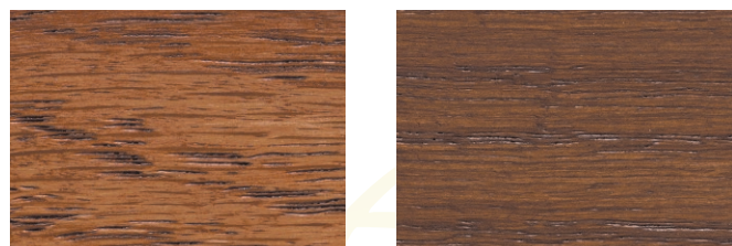
PREMIUM TEAKWOOD 120 MOCHA 119

Who said Blonds have more fun? Brown can fit in both cool and warm design – it's classic! Browns can blend classic design with modern lifestyle effortlessly. Warm wooden tones that vary from dark to light can add depth and panache to any room. If you are looking to achieve the relaxing vibe of a cozy, book-lined study or want to reinvent a space with a dynamic fusion of old and new the Classic Collection of colors is the one to choose.